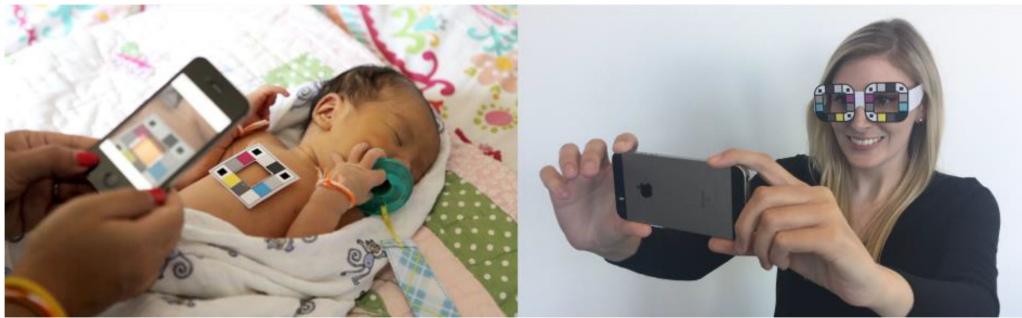
Figure 2. To account for different lighting conditions and camera sensors, both (left) BiliCam and (right) BiliScreen incorporate paper accessories with colored squares that can be used as calibration references.

Future Directions A smartphone operating system that offers more control over sensors and other smartphone components can accelerate exploration at the intersection of health and mobile sensing, especially when developers have access to raw sensor data. For example, the IR time-of-flight sensor can be used as a pulse sensor if an API exposes raw sensor values, avoiding the need for custom kernel solutions that cannot be widely deployed.